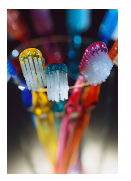
These toothbrushes should not be touching each other.

Follow the 14 day treatment guidelines. Contact your Head Start/Early Head Start nurse if you would like more information.