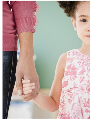
Staff will help your child get busy with an activity.

It is normal for children to become upset when being dropped off at school, especially at the beginning of the year or after a break. Here are some tips to help them and help you.