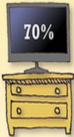
Televisions and furniture