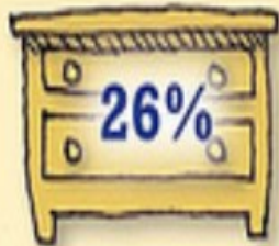
Furniture: dressers, tables